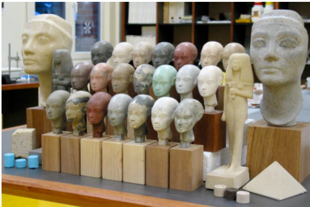
Figure 1: Examples of moulding in geopolymer stones (limestone, granite, sandstone, arkose, ...)

day, as a joke, I asked my scientific partners at the Muséum d'Histoire Naturelle de Paris what would happen if, we buried in the ground a piece of the product that we were synthesising in the laboratory at the time, and an archaeologist were to discover it in 3000 years' time. Their answer was surprising: the archaeologist would analyse this object disinterred from the garden of a ruin in Saint-Quentin, and the analysis would reveal that the nearest natural outcrop of the stone was in Egypt in the Aswan region! It was on that day that I realised that if I did not reveal the synthetic nature of the product we had developed, it would be taken for natural stone.