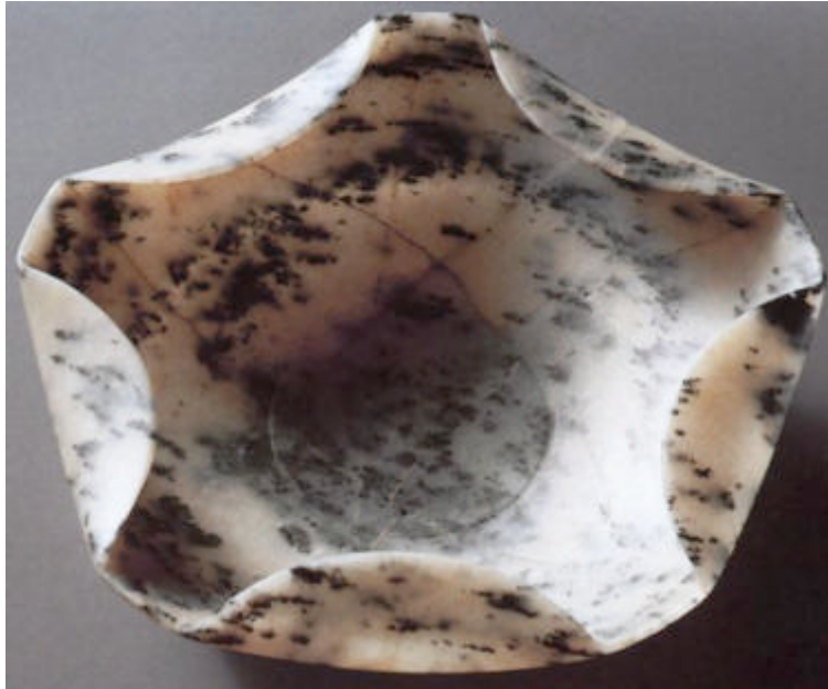
Figure 2: cup #99 in anorthositic gneiss, Catalogue of the exhibition: l'Art Égyptien au Temps des Pyramides, RMN 1999.

With its beautifully shaped curves and its wafer thin walls, how could such a vase have been fashioned? How could such a hard and crystalline material have been worked without being broken by the sculptor's chisel? To this, the experts have no answer, and are content to suggest that the craftsmen would have worked extremely slowly and minutely, chipping away at this very hard material millimetre by millimetre for a whole lifetime. No, clearly, the craftsmen used a technique similar to that of a potter, using instead of clay a stone paste developed through chemical knowledge and worked in a similar way.